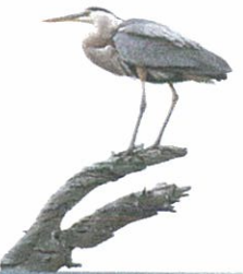
Figure 2: Great Blue Heron http://www.publicdomainpictures.net/viewimage.php?picture=great-blue-heron&image=3015 Photograph courtesy of Andrew Schmidt