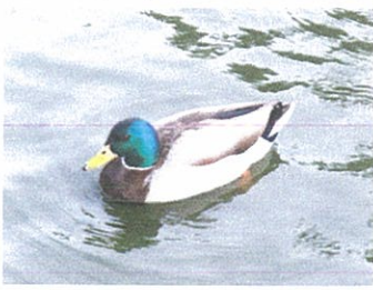
Figure 1: Mallard Duck