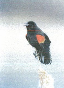
Figure 3: Red-Winged Blackbird http://www.fws.gov/digitalmedia/ , click on "Birds and Bird Management" Photograph courtesy of George Gentry.