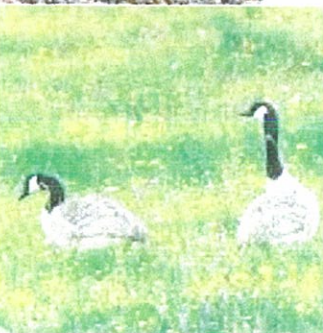
Figure 5: Canada Geese http://www.public-domain-image.com/animals/birds/goose/slides/canadian-geese.html Photograph courtesy of Rosendahl.