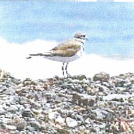
Figure 4: Killdeer